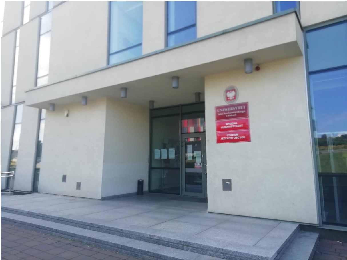
The building of the Faculty of Humanities which is the seat of the Centre